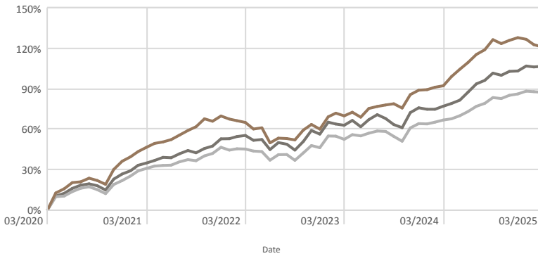
— Centaur BCI Balanced Fund (A) — ASISA Category — Fund Benchmark